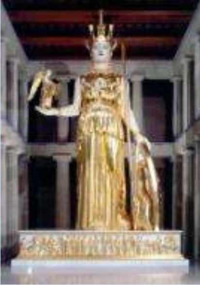
Figure 4 Athena Parthenos , replica of statue by Phidias from the Parthenon in Nashville, TN. Image from "Athena" at Nashville.gov 2 May 2013.