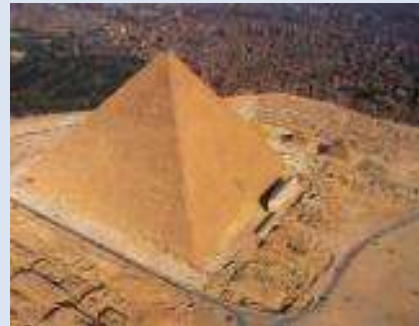
Figure 2 The Pyramid of Khufu at Giza from Tour Egypt.com 2 May 2013.