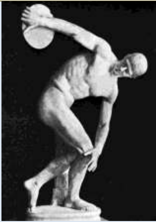
Figure 5 Discus Thrower by Myron (Roman Copy) from "Discobolos: Roman Copy" at Britannica.com 2 May 2013.

them all, you can't get a final grade, regardless of how many points you have earned.