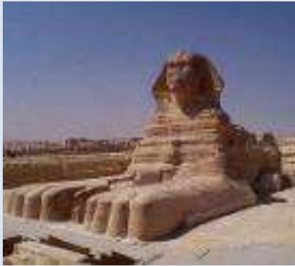
Figure 1 The Great Sphinx from Guardian.net 2 May 2013.