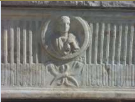
Figure 8. A Roman Sarcophagus at the Baths of Diocletian.

difficulties, this is your responsibility. If, however, you work ahead of deadlines and experience problems, I will be there to help!