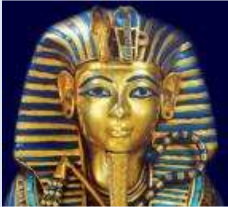
Figure 3 Death Mask of Tutankhamen from King-tut.org/uk 2 May 2013.