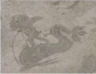
Figure 6 Cupid Riding a Dolphin. Mosaic from Roman Baths at Ostia Antica.