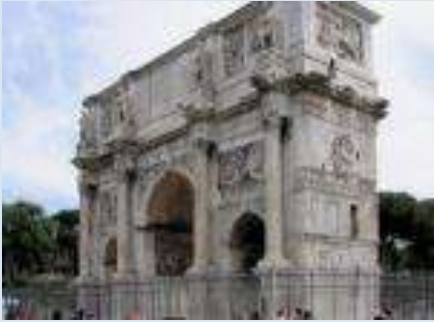
Figure 9 Arch of Constantine 2 May 2013.

(NTI) form from the Office for Students with Disabilities (OSD) and discuss specific needs with the professor, preferably during the first two weeks of class. The Office for Students with Disabilities determines accommodations based on appropriate documentation of disabilities. Here are the various offices you can contact about documentation: