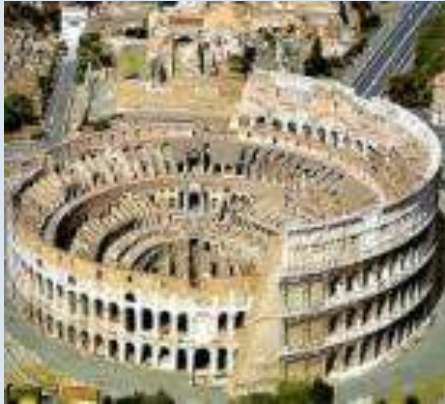
Figure 10 Colosseum in Rome 2 May 2013.

The course calendar and syllabus are subject to change as needed. Changes will be made via an electronic announcement through our online course. You will see any posted announcements when you log on. Your continuation in this course after the drop-add deadline has passed constitutes your agreement with and acceptance of the conditions presented in this syllabus.